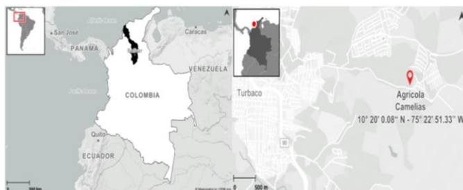
Figure 1. Location of the sampling site ( https://online.mapcreator.io ).

This research took place in Turbaco, a municipality in the Bolívar department of Colombia, which has a tropical savanna climate with moderate to high humidity and an average temperature of 30°C. The region experiences a rainy season from May to November, characterized by intense precipitation, while the dry season extends from December to April with little to no rainfall (IDEAM). Samples were collected at Agrícola Camelias, located at coordinates 10° 20' 0.08" N - 75° 22' 51.33" W. In this preliminary study, two samplings were conducted using the purposive sampling methodology. Seven leaflets of Musa sp. The specific sampling locations are illustrated in Fig. 1.