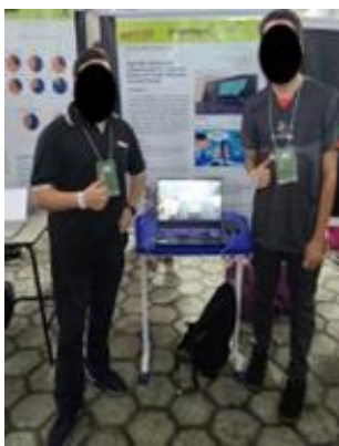
Fig. 4 Validation Process

The use of AI to construct an assistive prototype demonstrated a positive impact by promoting social inclusion and equal access to information for deaf and mute individuals in conventional environments. The prototype, developed in Python, utilized libraries such as "OpenCV," "Mediapipe," "Scikit-learn," and "Pytsx3" to convert gestures into audio, providing a complete communication experience with audio feedback in Portuguese.