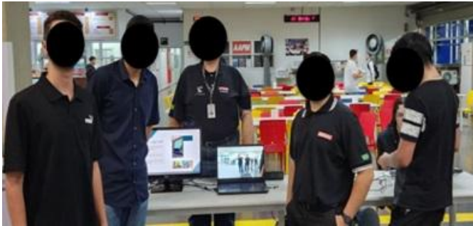
Fig. 3 Development and Testing

A prototype for inclusion was developed and tested in various scenarios by Libras teachers and deaf-mute students, as illustrated in Fig. 3 and Fig. 4.