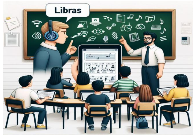
Fig. 1 Personalized and Inclusive Education

This study further explores how AI can make education and knowledge construction more inclusive and accessible, providing support for students with and without special needs. AI-driven systems are assessed for their ability to offer quality and up-to-date educational resources, as shown in Fig. 1, which outlines the research design.