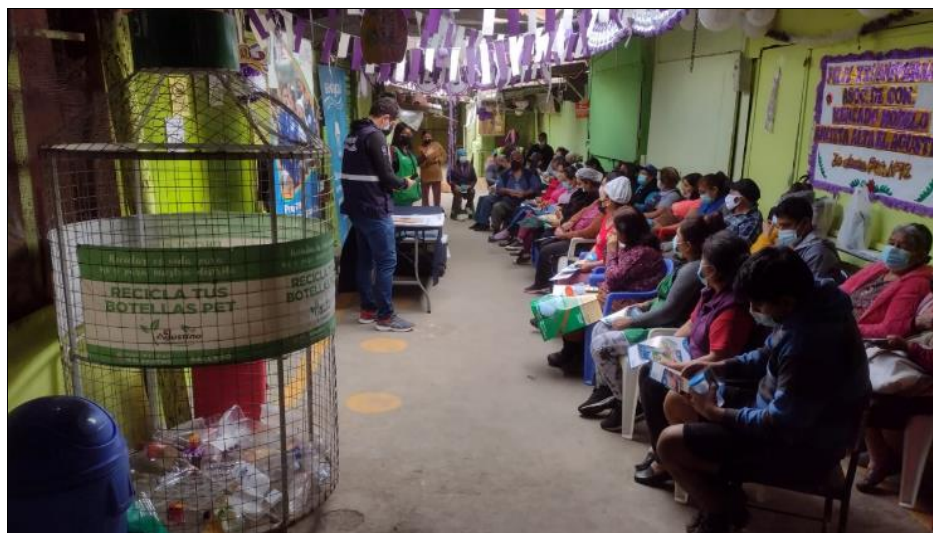
Fig. 2 Awareness talks applied to traders of the "Ancieta" supply market

Ha: Eco-Business has a positive influence on the environmental awareness of traders in the "Ancieta" supply market, Lima, 2021.